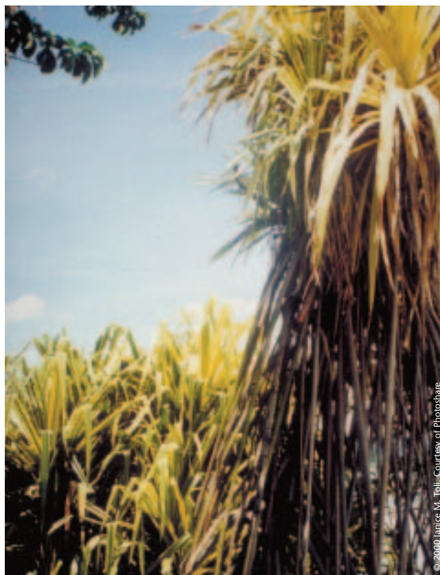
A sugarcane field in Uganda

The following matrix, adapted from the UK Department for International Development's 2002 report "Energy for the Poor: Underpinning the Millennium Development Goals," lays out the direct and indirect links between energy and the MDGs: 22