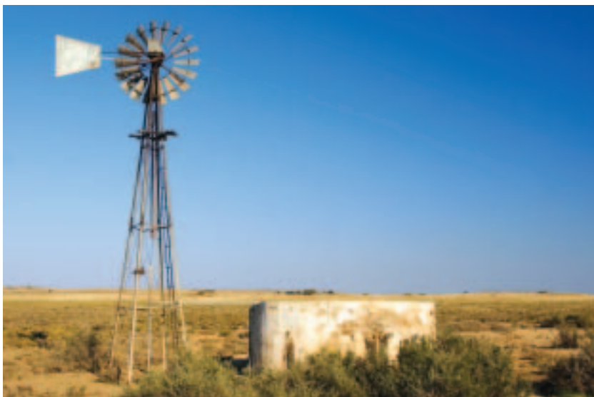
Wind pump outside Colesberg, Africa

It is estimated that the minimum amount of modern energy needed annually to meet basic cooking and lighting needs is 50 kgoe per capita. However, societies also need to educate children, ensure good health and access to clean water, and provide energy for various productive uses. It is therefore estimated that societies require 400 kgoe of energy per capita to fall safely above the energy poverty line. “Energy Services for the Poor,” commissioned for the Millennium Task Force on Poverty, calculates that achieving an increase in per-capita modern energy consumption in developing countries from 50 kgoe to 500 kgoe will lead to a 50-percent reduction in the number of people living in poverty. The authors predict that total annual public funding needed to meet these targets by 2015 is $14.3 billion total, or $20 per capita. 26