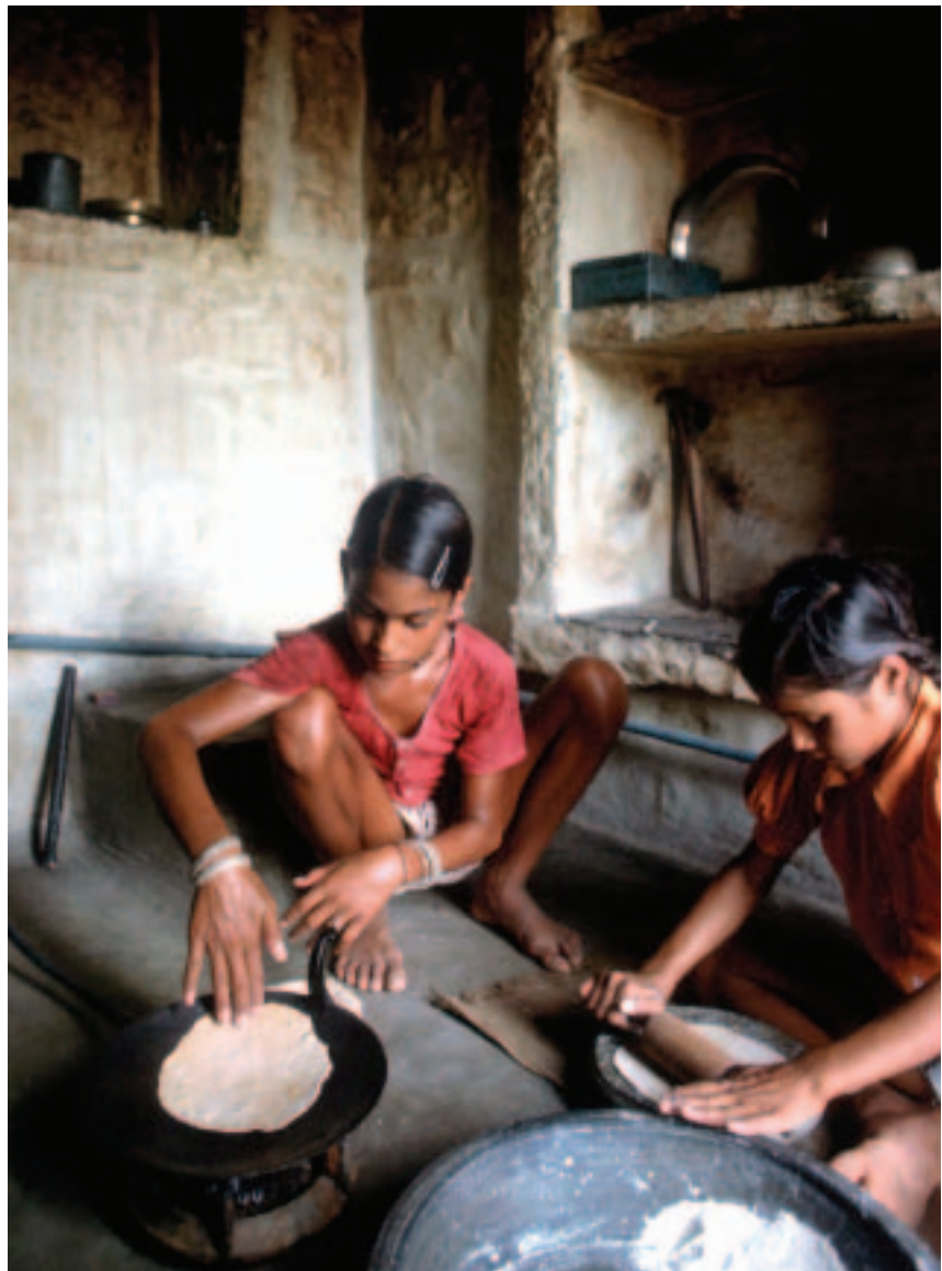
Biogas cooking from cow dung in India