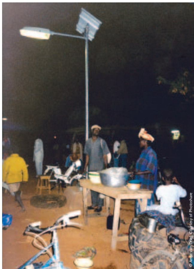
Women prepare food under solar street lighting in Burkina Faso

In many situations, the largest consumer of energy services is government. As governments recognize with their own purchasing the values of RETs, costs can be reduced through economies of scale, initial investment costs can be shared with private citizens and companies, and awareness of renewable energy's potential can be more widely disseminated. By integrating renewable energy into rural electrification, rural development, poverty-alleviation, and social welfare programs, the effectiveness of these programs can in many cases be advanced.